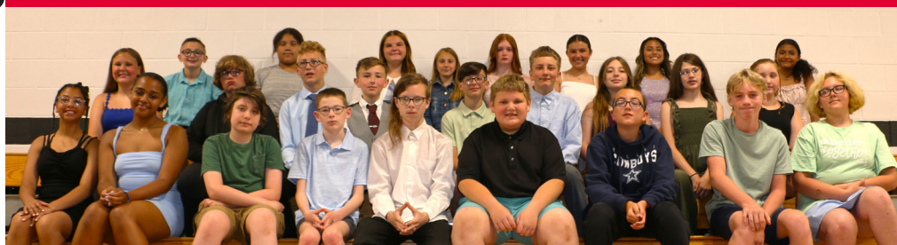
6TH GRADE GRADUATION

Thank you to Confidential Planning: Member of Pinnacle Family of Companies for sponsoring this issue of the Leopard's Tale.